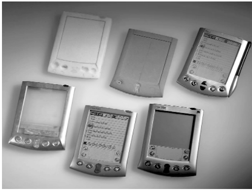
The Palm V, from early prototypes in foam and machined aluminum to the final product with a stamped aluminum housing.