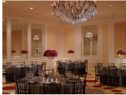
The Stanford Court, venue for DMI's Design/Management/Brand conference